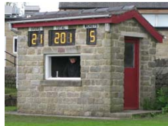
Hampsthwaite Cricket Club