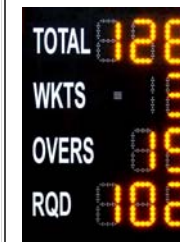
Haddenham Cricket Club