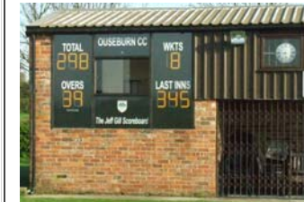
Ouseburn Cricket Club **Wireless**