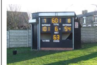
Darfield Cricket Club **Wireless**