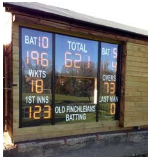
Old Finchleas Cricket Club