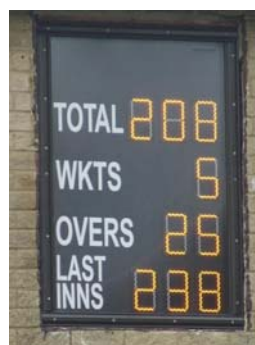
Gomersall CC Repeater