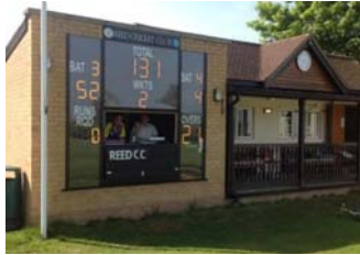
Reed Cricket Club