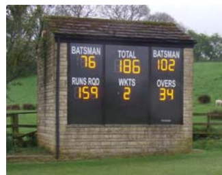
Addingham Cricket Club **Wireless & Battery Powered**