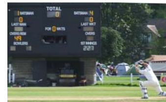
Bradford and Bingley Cricket Club