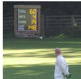
Bluberhouses Cricket Club **Wireless & Battery Powered**