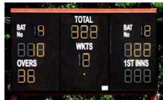
Paultons Cricket Club **Wireless & Battery Powered**