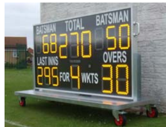
Murton Cricket Club **Wireless**