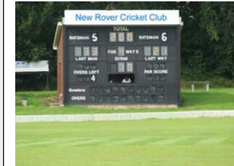
New Rover Cricket Club