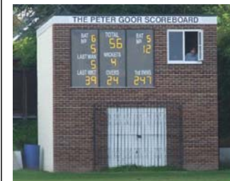
Adwalton Cricket Club