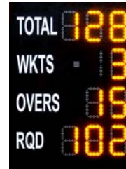
Shepperton Ladies Cricket Club