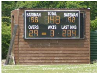
Hook Cricket Club, Pembrokeshire