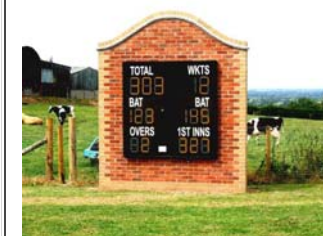
Alberbury Cricket Club