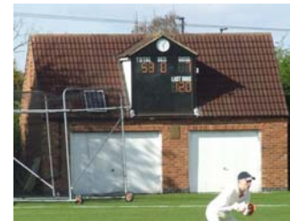
Heworth Cricket Club