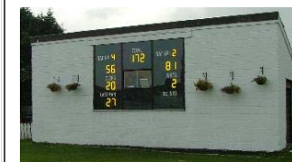
Bill Quay Cricket Club