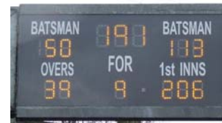
Great Horton Cricket Club