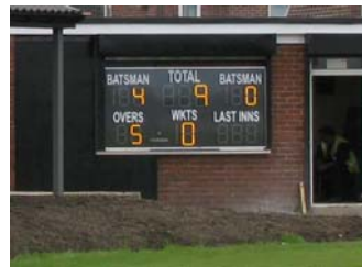
Hylton Cricket Club