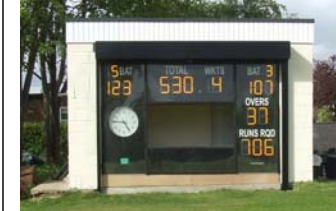
South Woodford Cricket Club