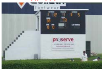
Cleckheaton Cricket Club