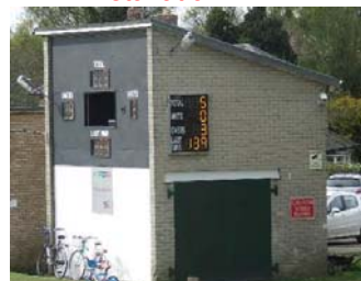
Acomb Cricket Club **with Repeater**