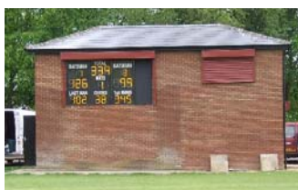
Abbots Langley Cricket Club

For a printable version (PDF) of this page so you can discuss our scoreboards at your committee meetings click here