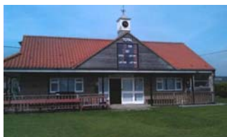
Ebberston Cricket Club