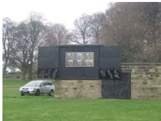
Horseforth Hall Park Cricket Club