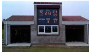
Seaham Harbour Cricket Club