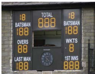
Broad Oak Cricket Club