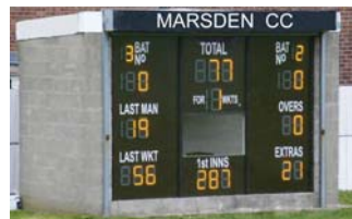
Marsden Cricket Club