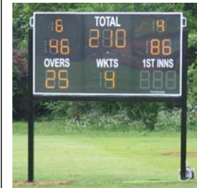
John Lyon School