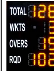
Hindhead Cricket Club