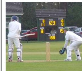
Follifoot Cricket Club