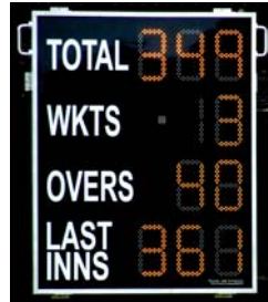
Renfrew Cricket Club