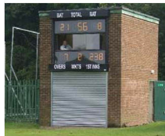
Peterlee Cricket Club