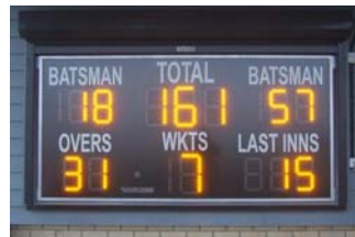
Isleham Cricket Club