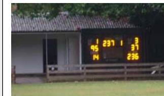
Chiswick House London Chiswick and Latymer Cricket Club and Ealing Wanderers Cricket Club