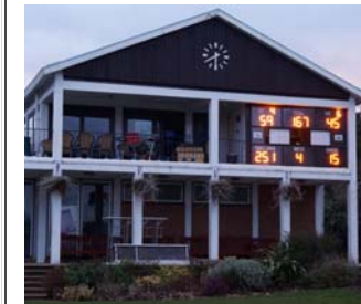
King Edwards School Cricket Club