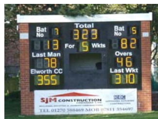
Elworth Cricket Club **Wireless & Battery Powered**