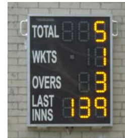
Meakins Cricket Club