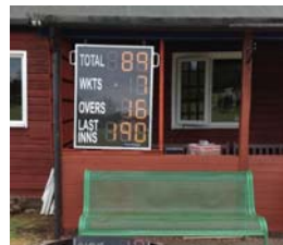
Clifton Cricket Club Bedfordshire