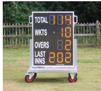
Oughtibridge Cricket Club **Wireless & Battery Powered**