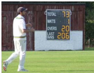
Birstwith Cricket Club **Wireless & Battery Powered**