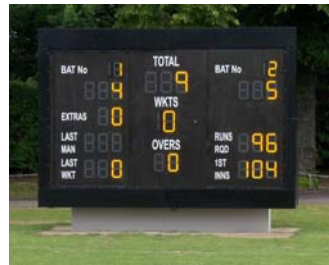
St Edwards School Cricket Club Oxford