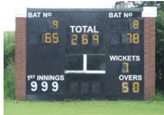
Wroxeter Cricket Club