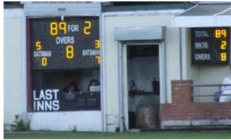
Moorlands Cricket Club **with Repeater**