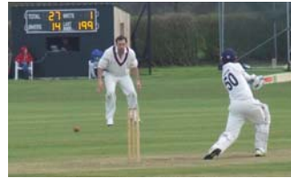
Newby Hall Cricket Club **Wireless**