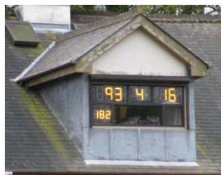
Castle Eden Cricket Club