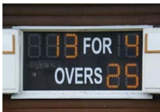
Ashover Cricket Club