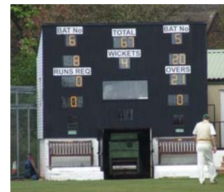
Pudsey St Lawrence CC **Wireless**