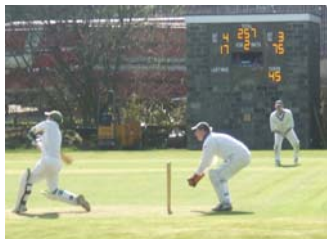
Pateley Bridge Cricket Club **Wireless**