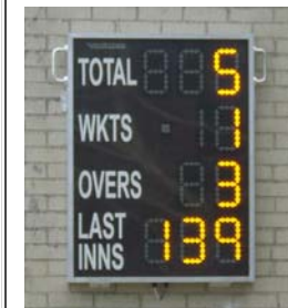
Puttenham Cricket Club