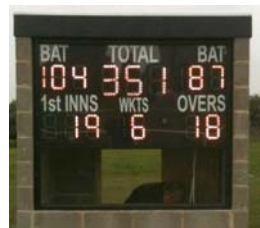
Caribbean Cricket Club Leeds **Battery Powered**