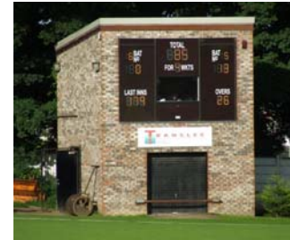
New Farnley Cricket Club **Wireless**