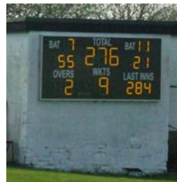
Hawk Green Cricket Club