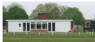
Defence School of Transport Cricket Club Beverley **Battery Powered & Wireless**