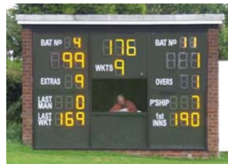
Drighlington Cricket Club **Battery Powered**