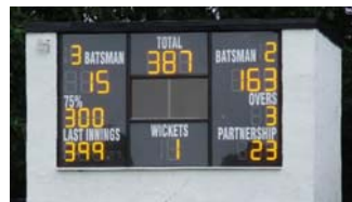
Beckwithshaw Cricket Club **Wireless**