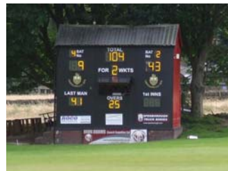
Lightcliffe Cricket Club