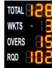
Oxford University **Wireless & Battery Powered**