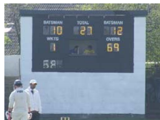
Bankfoot Cricket Club