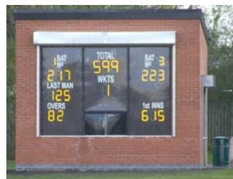
Elton Vale Cricket Club