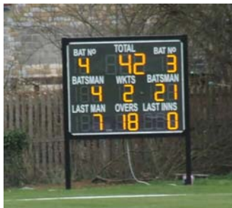
Kirby Moorside Cricket Club