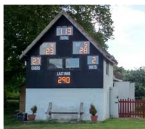
Bolton Percy Cricket Club **Wireless**