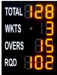
Spondon Cricket Club