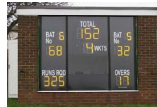
Easington Cricket Club **Battery Powered**