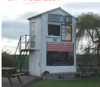
Goldsborough Cricket Club **Wireless**