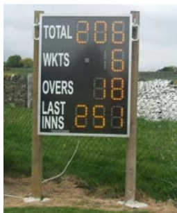
Denby Cricket Club **Battery Powered & Wireless**