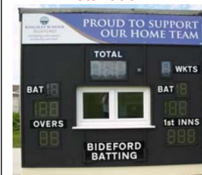
Bideford, Littleham & Westward Ho! CC