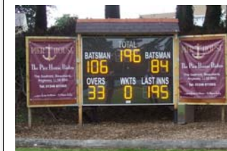
Menai Bridge Cricket Club