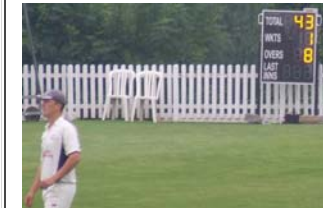
Brixworth Cricket Club