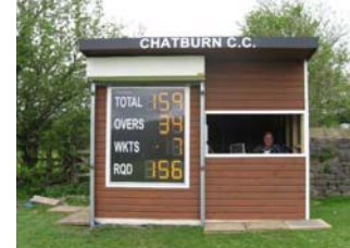
Chatburn Cricket Club **Battery Powered**