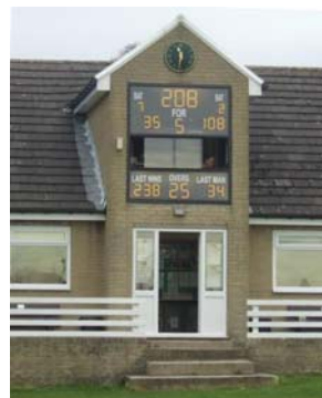
Gomersall Cricket Club **Wireless**