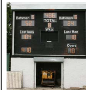
East Ardsley Cricket Club